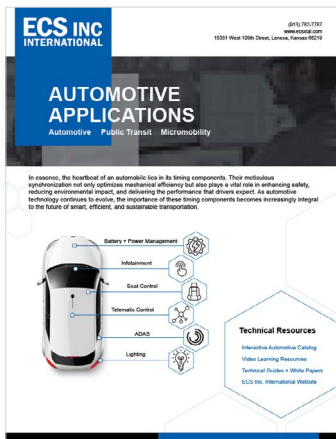
Transportation Application Overview

Below are several transportation-based materials to enable you and your team to sell ECS Inc. International AEC-Q200 qualified product.