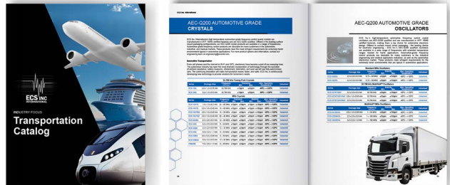
Interactive Automotive Catalog